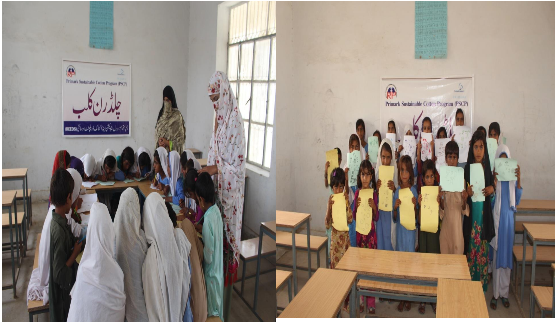
Drawing Competition on Child Rights ( Education)