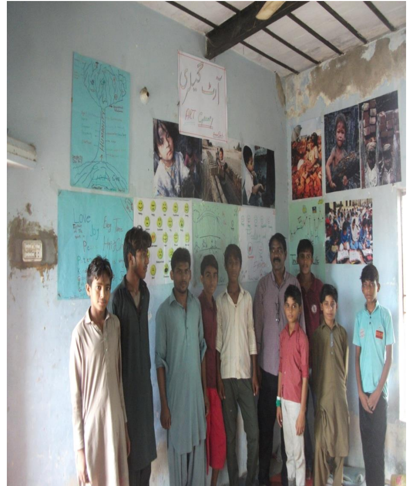
Children Art Gallery to promote Child Rights