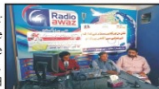
FM awareness session being aired

Radio Awareness Program: Awareness raising through FM Radio program is regular and routine practice of REEDS. This month more awareness raising Radio programs were conducted for capacity building of audiences. Experts from REEDS and Agriculture Extension Department participated the Radio Awareness Program for locust control. Different questions were asked from the audiences which were answered by experts and audiences were satisfied for their queries.