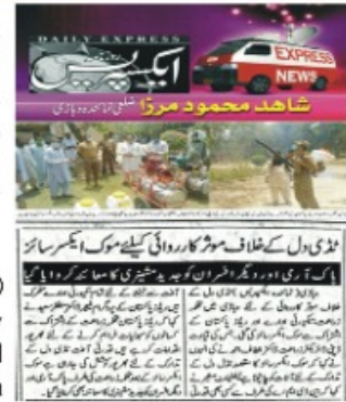
News in National Newspaper of Mock Exercise at Vehari