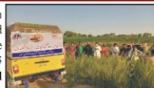
Rickshaw in filed announcing locusts control measures for farmers

Rickshaw/Mosque Announcements: Awareness campaign using rickshaw with speakers installed on it and through mosque announcement about locust control activities and timely reporting to Agriculture Extension Department and Locust information Cells in case of locust attack. The rickshaw moves from one village to other covering about 10 to 15 villages in one whole day. During this campaign the team distributes the awareness material too on which contact details of locust information cell is mentioned. On an average 3000 to 4000 audiences are benefited during one rickshaw campaign.