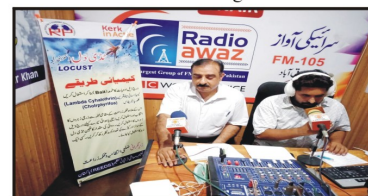
FM-105 awareness Program being aired