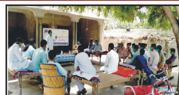
Male & female farmers being aware by REEDS Team

Capacity building of Farmers (Male & Female): Farmers were made aware of first aid practices in case of locusts attack by organizing group meetings (observing SOPs to control the spread of COVID-19), face to face personal meetings and conveying the messages about locust control & preventive measures through social media. To overcome the challenges being faced due to lock down as a precautionary measure of COVID-19 REEDS has taken a bold step of online meetings with its beneficiaries. Experts built the capacity of farmers about locust management by using online software like "go to meeting" on Android Cell phones. The cost for these online training was paid by REEDS for the benefit of farmer. This initiative was highly appreciated by various stakeholders and forums. REEDS is taking care of equal participation of female farmers in these capacity building programs for locust awareness. A sum of 4700 male & female beneficiaries were trained in above mention program.