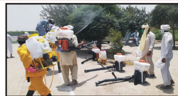
Mock exercise being conducted

Handing Over of machines & tools: REEDS handed over Engine operated spray machines, plunger machines, pesticide and protection kits & double filter spray man masks to district governments and agriculture extension departments of target districts.