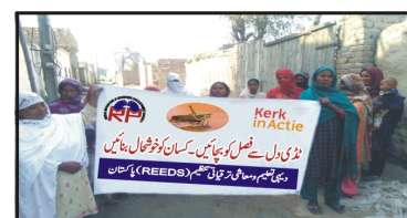
Women participating in awareness walk

Awareness Walks: Awareness walks were conducted with support of Agriculture Extension Department and District Administration. More than 50 members from REEDS Agriculture Department, Pest Warning and District Government participated the walk holding banners and play cards with slogans to aware people how combat locusts attack. Females of all ages participated the awareness walk. Participant were holding play cards for control of locust.