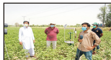
Field trial of sound producing machine