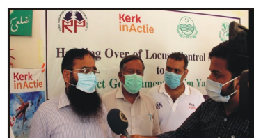
AC, HR, RYK during inauguration of locust information cell at DC Office RYK