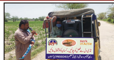
A Raksha In the field announcing awareness slogans

Rickshaw and Mosque Announcement: Rickshaws and Mosque announcements were made for locust awareness benefitting a sum of 4500 audiences from all of the three target districts in local as well as national language. The people were made aware for first aid activities and were guided to report the information cell in case of locust attack. The awareness slogans used for announcement were designed by collaborating of Agriculture Extension Department.