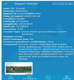
REEDS regularly updates the "eLocusts" mobile application after surveys and operations

Different surveillance surveys and combat operations were conducted in all the three districts under the leadership of Director Agriculture, Deputy Directors Agriculture Extension Assistant Directors and an immense team of field assistants. Deputy Commissioners of all the districts personally supervised the operation and as a result 676316 hectares where surveyed Its great farmers themselves took many initiatives and also supported the teams to control the locust.