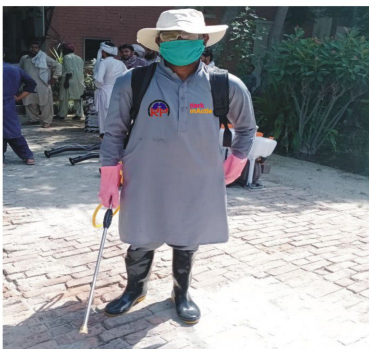
A spray man ready for his services