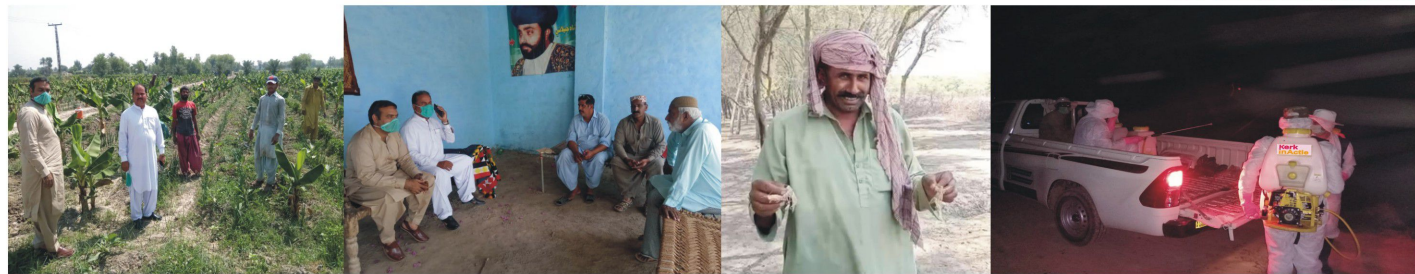
Different Photos from the Gallery of REEDS during Locust surveillance & comeback operation with support of AED & District Administration.