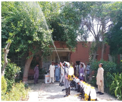
REEDS Vehari with support of AED conducting Mock Exercise